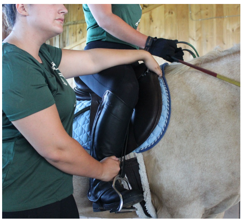
Thigh and ankle support