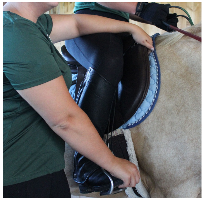
Thigh and toe support